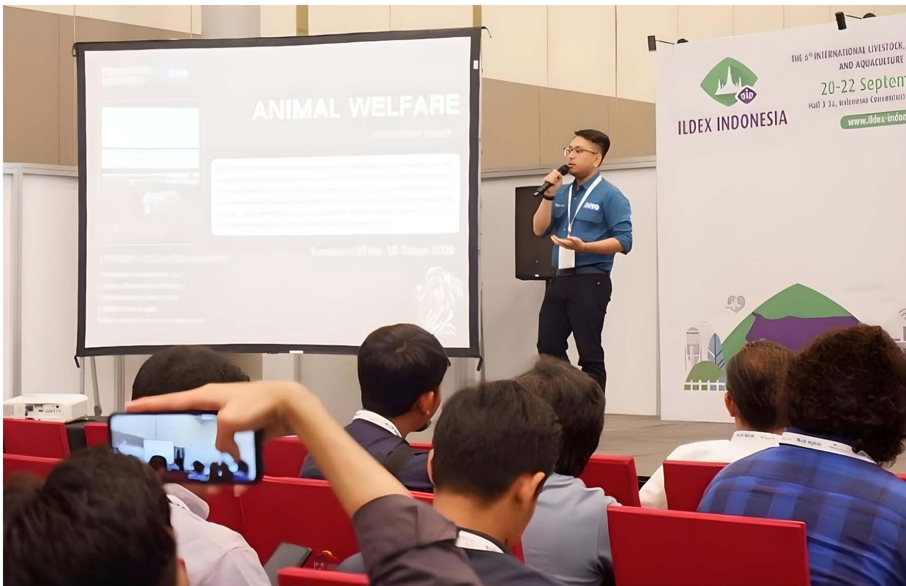
Forum AWO Indonesia sharing information about their role safeguarding the Australian cattle industry and animal welfare.

In September, the Forum AWO Indonesia also participated in the 6 th International Livestock, Dairy, Meat Processing and Aquaculture Expositions 2023 (ILDEX) held from 20 th -22 nd of September. This gathering drew a diverse array of associations and companies from the agricultural sector, representing both domestic and international interests. This opportunity provided a significant milestone as it marked the first time that Forum AWO Indonesia independently participated in a national level expo dedicated to the livestock industry. The event served as another important avenue for Forum AWO Indonesia to introduce the organization and its ongoing program to a wider audience. At the event the Forum AWO also delivered a seminar about the significance of animal welfare, including the humane handling of animals, that was warmly received by the national and international audience.