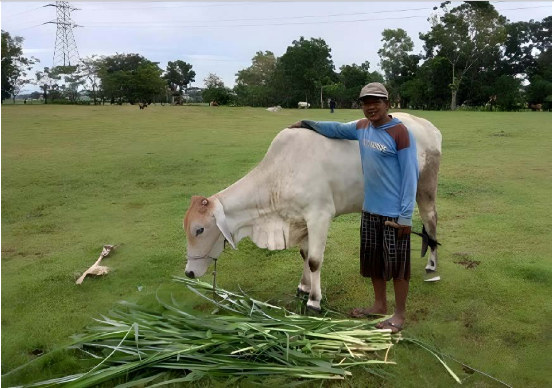
A farmer in Sidenreng Rappang, South Sulawesi, watches over his group's cattle herds as they graze in an open area. In collaboration with the Indonesian government, at the national and regional level, SC2VP support improved cows health and production through technical guidance, infrastructure improvements, and pasture cultivation.