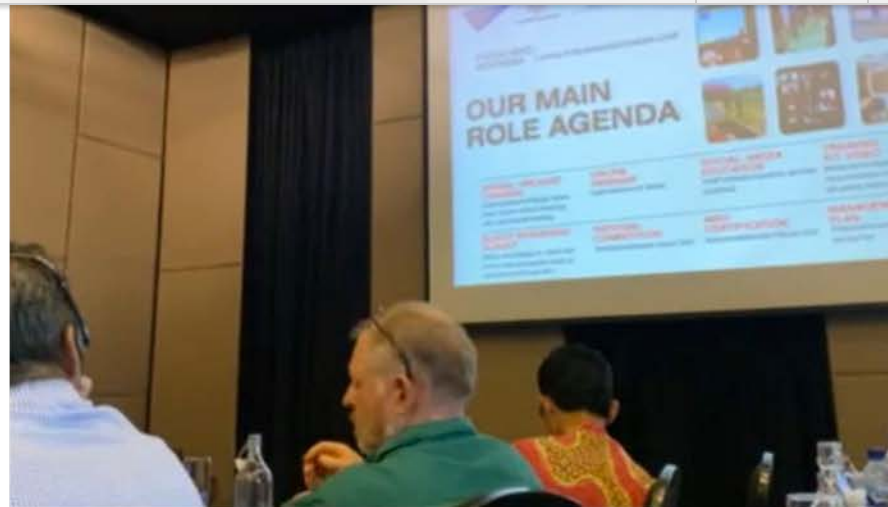
Forum AWO Indonesia shares the overview of the forum activities to industry members at the Exporter-Importer Meeting on 22 September 2023.

In September, the Forum AWO Indonesia also participated in the 6 th International Livestock, Dairy, Meat Processing and Aquaculture Expositions 2023 (ILDEX) held from 20 th -22 nd of September. This gathering drew a diverse array of associations and companies from the agricultural sector, representing both domestic and international interests. This opportunity provided a significant milestone as it marked the first time that Forum AWO Indonesia independently participated in a national level expo dedicated to the livestock industry. The event served as another important avenue for Forum AWO Indonesia to introduce the organization and its ongoing program to a wider audience. At the event the Forum AWO also delivered a seminar about the significance of animal welfare, including the humane handling of animals, that was warmly received by the national and international audience.