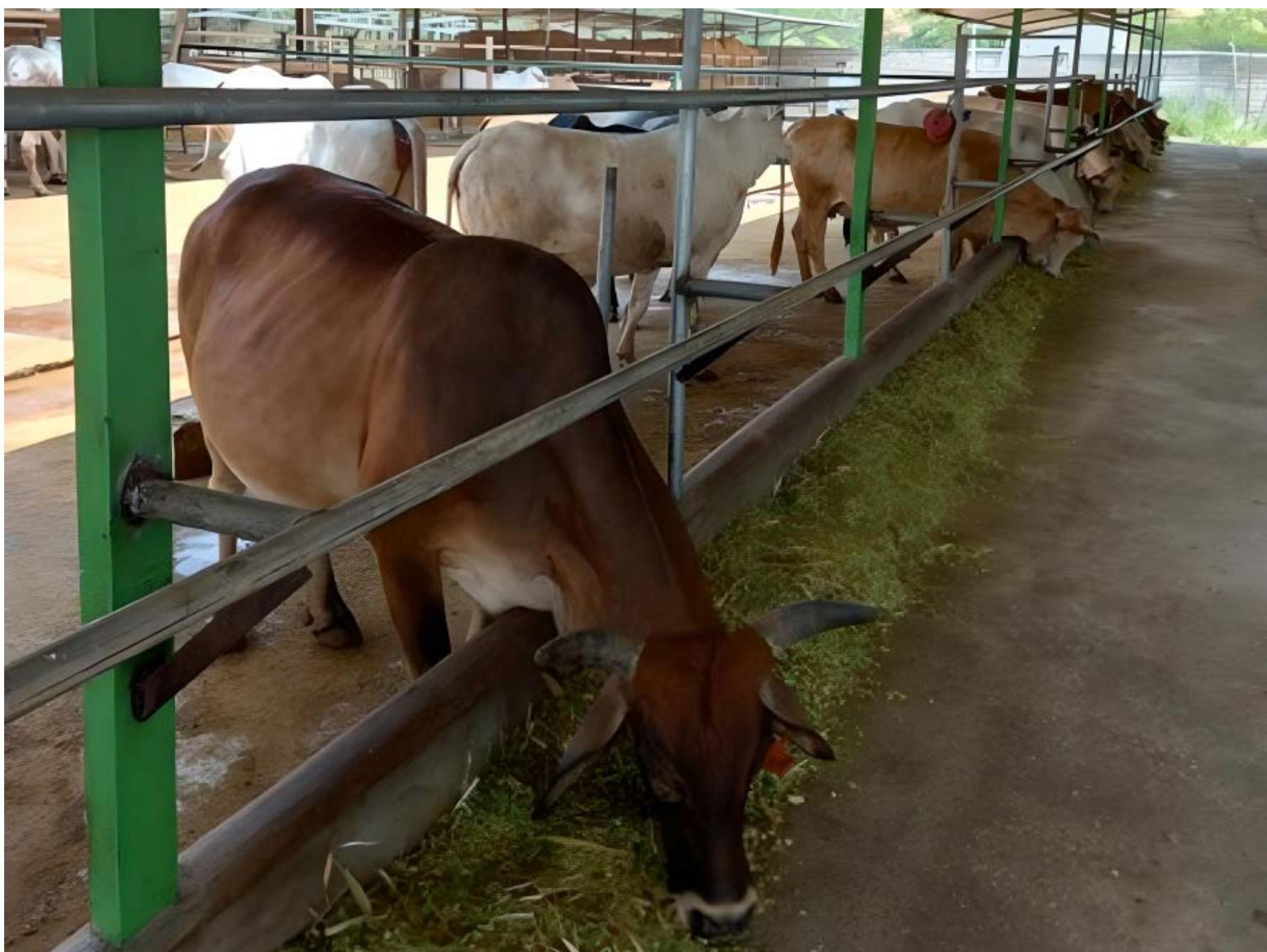
Cows feeding at a SC2VP site.

The SC2VP, delivered in cooperation with the Indonesian Society for Animal Production (ISPI), completed in September after a 15-month journey providing assistance to five Cattle Corporation Village (CCV) sites in Cianjur, West Java; Boyolali, Central Java; Kediri, East Java; Penajam Paser Utara, East Kalimantan; and Sidenreng Rappang, South Sulawesi. The project made notable contributions to improving cattle welfare, health, production, and infrastructure in the five project locations.