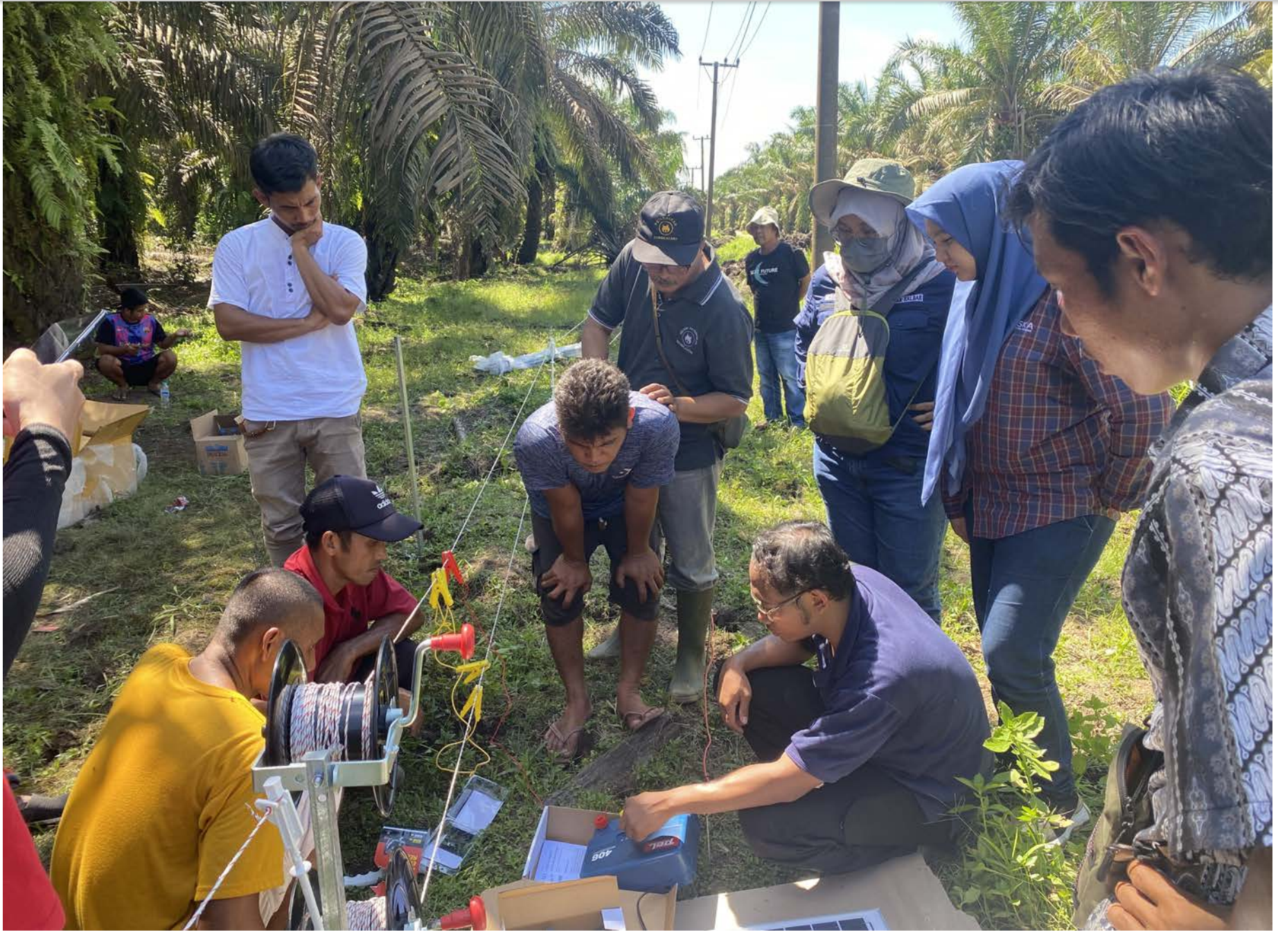
A training instructor explaining to farmers how to install an electric fence and check the electricity voltage (Photo: Partnership).