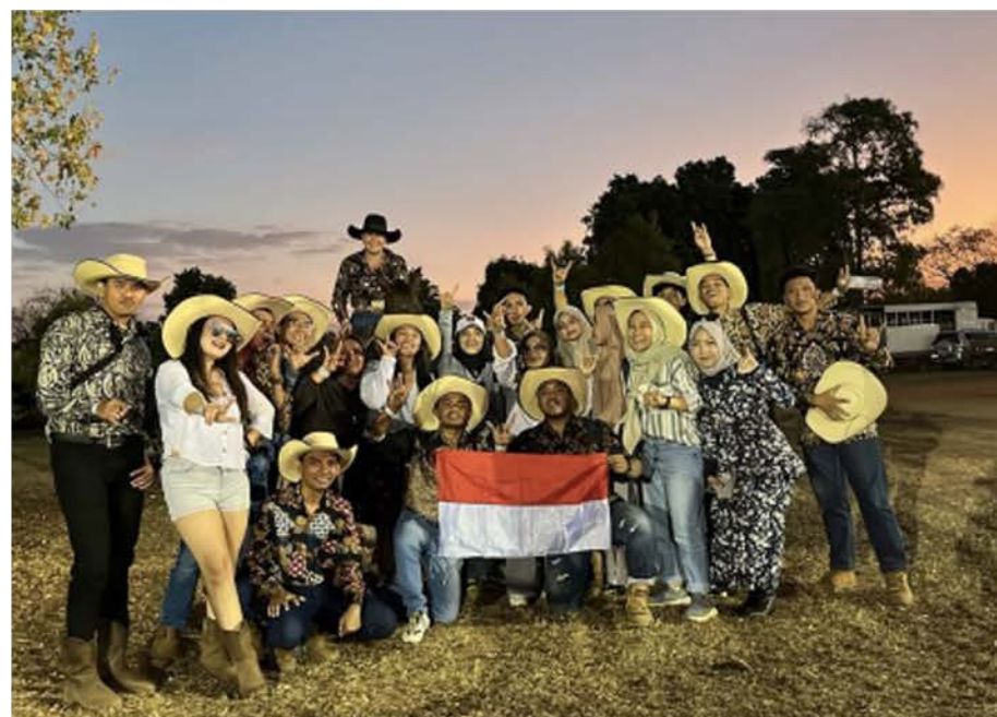
One of the student during the placement at cattle station (left) and all the NTI360 program students (right) (Photo: NTCA).

After completing the training, the students were then ready for their 6-weeks placement on cattle stations where they learnt not only about the cattle production technical skills but also Aussie outback culture. The valuable experiences, learnings and new Australian industry contacts have prepared these next generation of industry leaders to advance Indonesia's livestock sector.