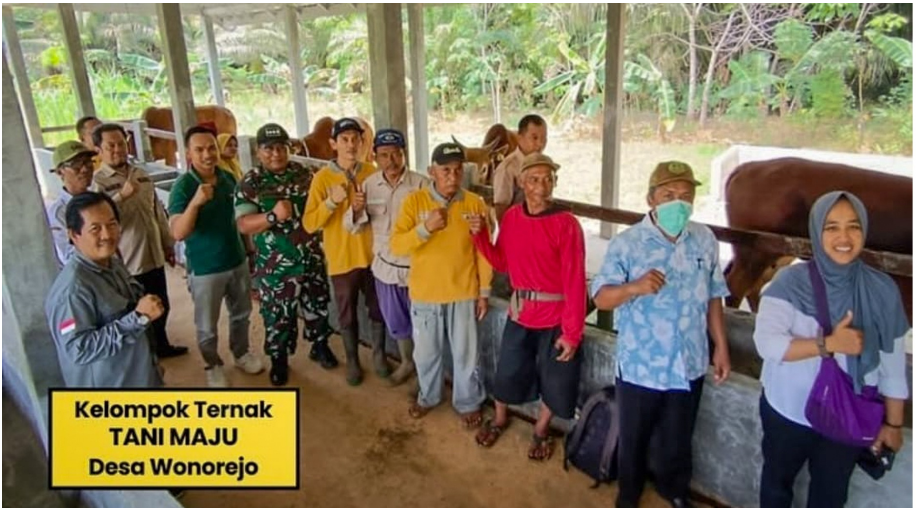
The Plantation and Livestock Office of South Kalimantan Province handing over four bulls to the Tani Maju Cluster in Tanah Bumbu district.

The Government of Indonesia continues to strengthen its commitment to cattle/oil palm integration - known as SISKA. In March the former Indonesian Minister of Agriculture visited the Tanah Bumbu SISKA site in South Kalimantan to officially kick start SISKA KU INTIP, a provincial government program actively being supported by the Partnership's SISKA Supporting Program (SSP). One outcome of the Minister's visit was the distribution by the DGLAHS of 14 local bulls to 6 SISKA groups in September. The bulls were provided to improve the genetics of the local Bali cows in the herds, to prevent inbreeding, and to advance SISKA in South Kalimantan.