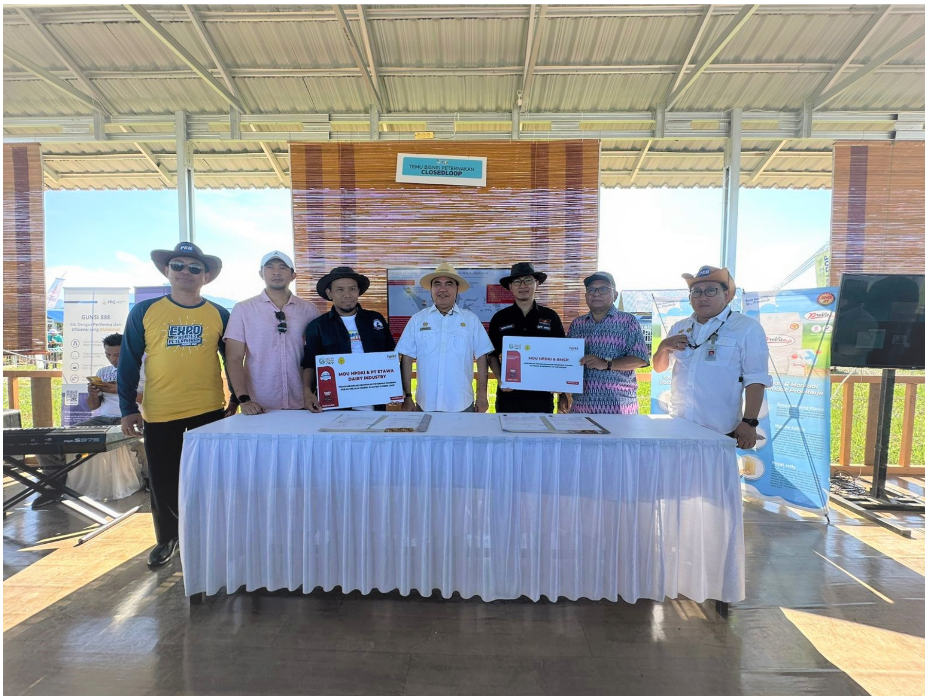
photo: Agreement signing at the National Week on Agriculture and Livestock

Participants gathered information on how Australian sheep organisations are run, how genetic management is ensured, and how Australia keeps track of breed genetics to ensure a fair business environment. One very valuable outcome from the visit was networks built with industry members including from the Dorper Sheep Society of Australia and the Dairy Goat Association of Australia. The visit concluded in the Sydney MLA office where the delegation was provided an overview of the Indonesian and Australian sheep markets and interactions between the two, and potential collaborative opportunities.