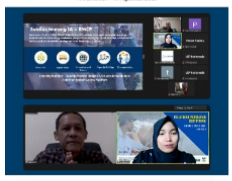
Pada hari ini sebanyak 143 peserta, mengiketi Pelatikan Persiapan Bertifikas AWD 2021 sacara online yang diadakan Partnership bersama Hest & Uvastoci Austrana AMD N

Petathan ontre ini ditujukan untuk anggosa rorum kiwo indonesia sebagai persyaratan untuk mengikuti sertifikasi profesi animal weltare officer di BNSP.